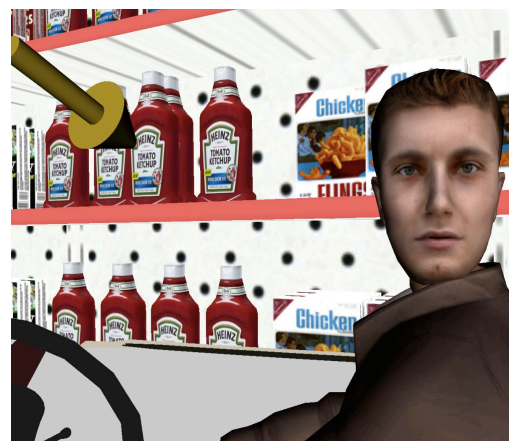
Figure 1. VIRTUO in the virtual supermarket, from the perspective of a participant. The arrow indicates the next item that VIRTUO and the participants should discuss (here, ketchup). The steering wheel of the virtual golf cart is visible in the bottom left corner.

VIRTUO was represented by a stock avatar produced by WorldViz. The avatar's appearance suggested that he was a Caucasian male in his mid-twenties (the average age guessed by participants in debriefing was 26 years old), which matched the age of the Dutch speaker who recorded his speech.